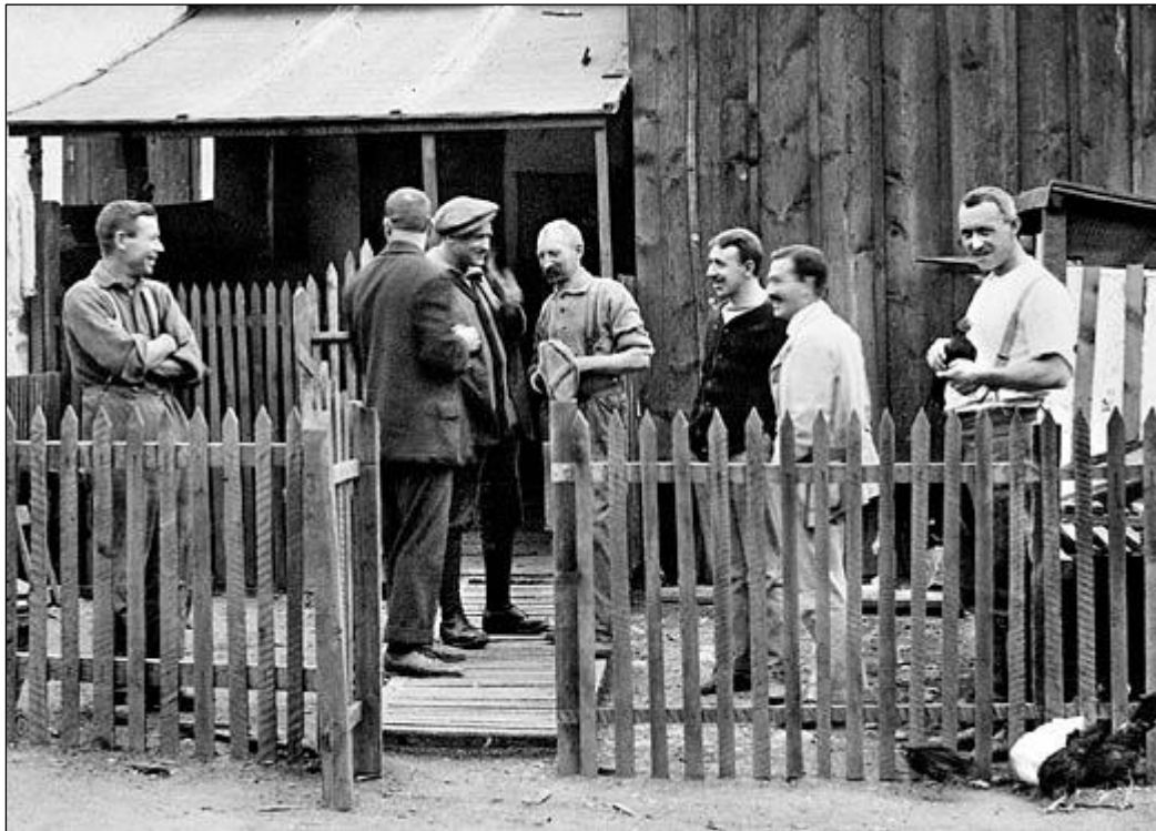
Australian and British prisoners of war outside their quarters at Belemelik, Taurus Mountains, Turkey, in 1918. Among them are members of the crew of the Royal Australian Navy's submarine AE2, captured after their boat was scuttled in an action in the Sea of Marmara on 30 April 1915. All but four survived captivity and were repatriated at the end of the war. [AWM H19414]

In March 2010, following an overhaul of the RAN Battle Honours system, AE2 was retrospectively awarded 'Rabaul 1914' and 'Dardanelles 1915'.