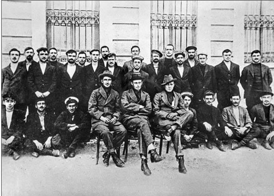
The crew of the RAN submarine AE2 photographed after being captured by the Turks on 30 April 1915. In the AWM's caption to this image none of the crew members is identified. Given that this appears to be the whole crew, officers and men together, it was most likely taken shortly after their capture, possibly in Istanbul where they had been taken by early May.

All of the crew survived the attack and were captured by Sultan Hisar and survived the war except for four who died from illness while in captivity.