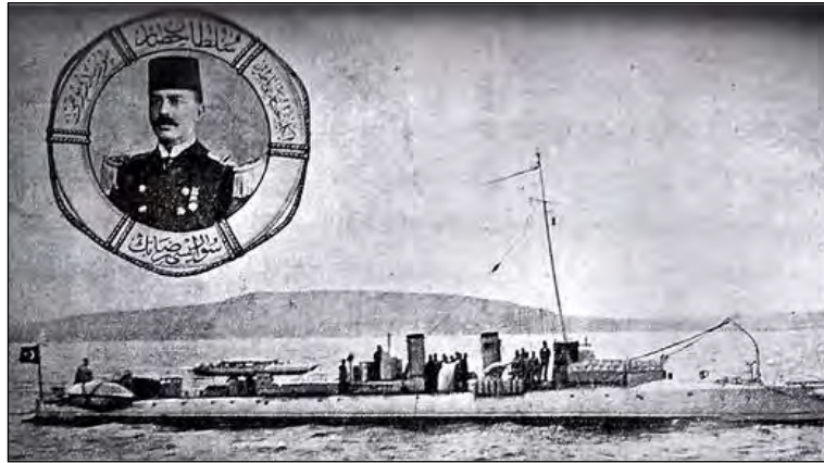
The Ottoman Torpedo Boat 'Sultan Hisar'

When AE2 reached the rendezvous point on 30 April, smoke from the Turkish torpedo boat Sultan Hisar was sighted. AE2 submerged and moved to investigate. At 10:30, about a mile from the torpedo boat, AE2 inexplicably rose and broke the surface.