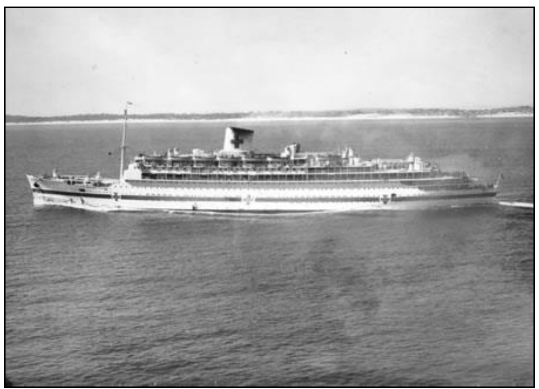
The 'Oranje' off the Western Australian coast in 1941, shortly after the completion of its conversion as a hospital ship. The red crosses and green stripes on the white hull were meant to be a conspicuous reminder to enemy vessels of its non-combatant role.