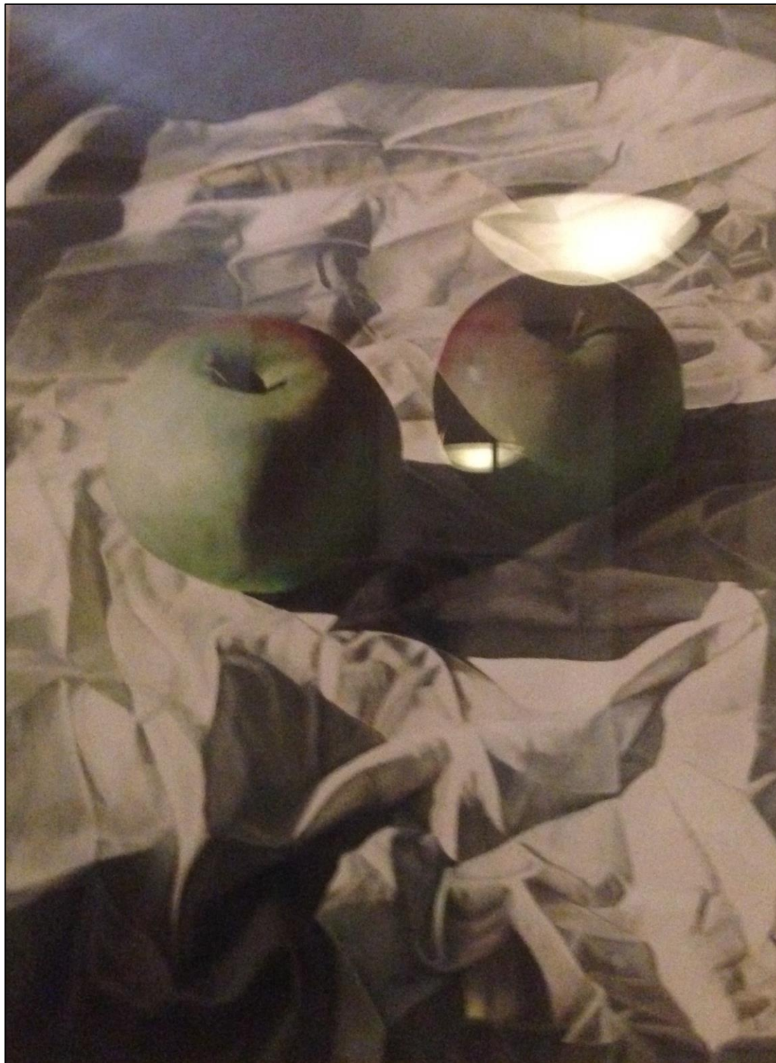
Two Green Apples (in the Owen Room)

The Club purchased Two Green Apples that hangs in the Owen Room.