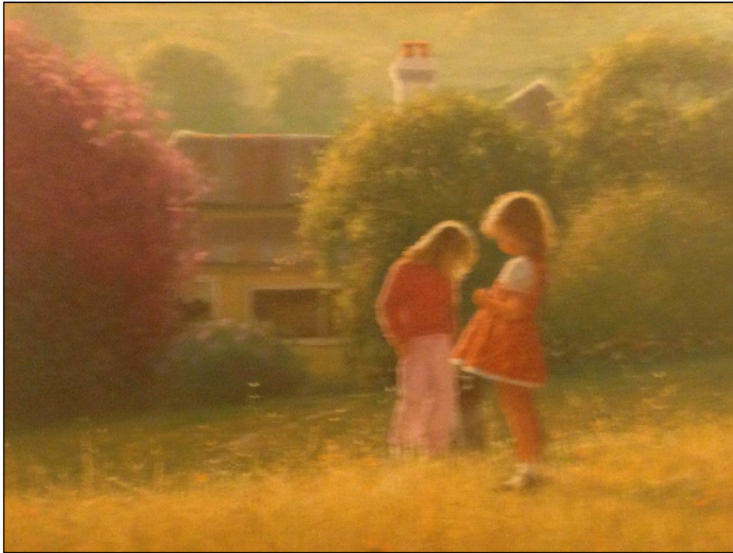
Best of Friends (in the Owen Room)