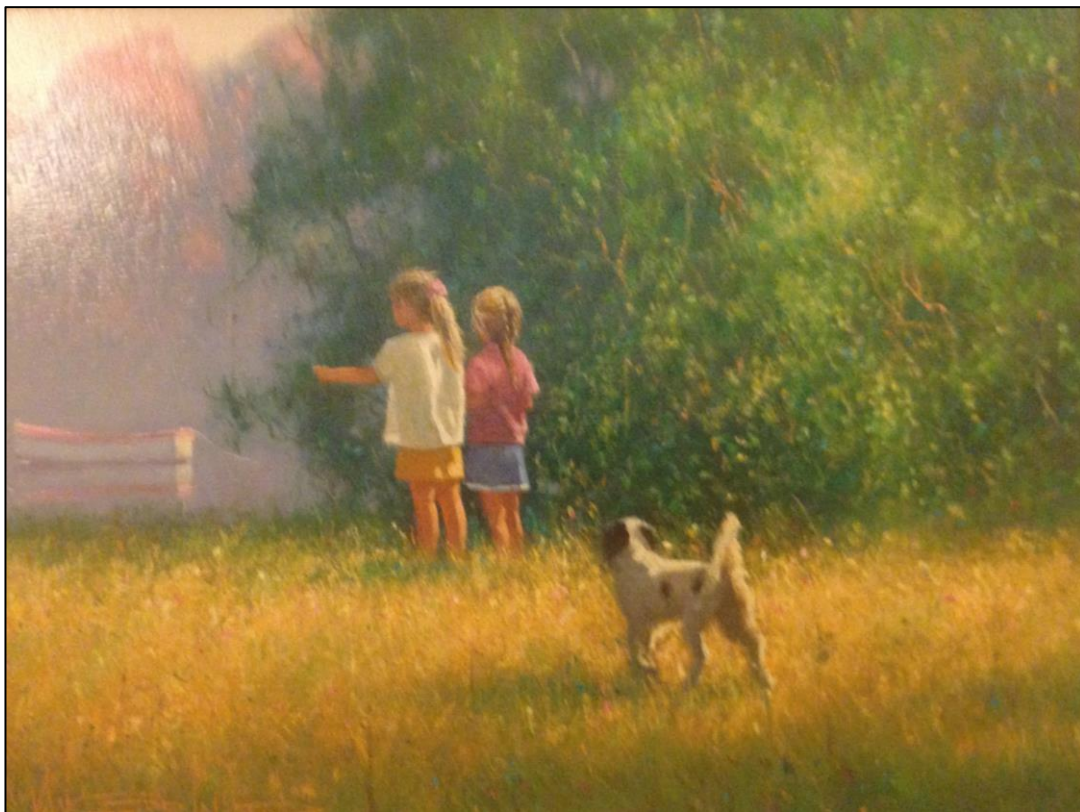
Well, look at that! (in the Owen Room)