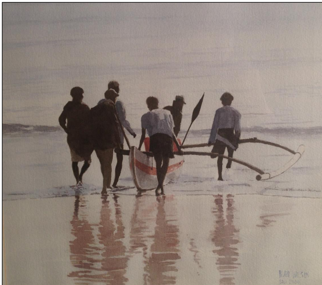
Bali Seaside (Level 2, near the elevator)

The Club purchased one of these works titled Bali Seaside that now hangs in the rear porch of Level 2 (near the elevator).