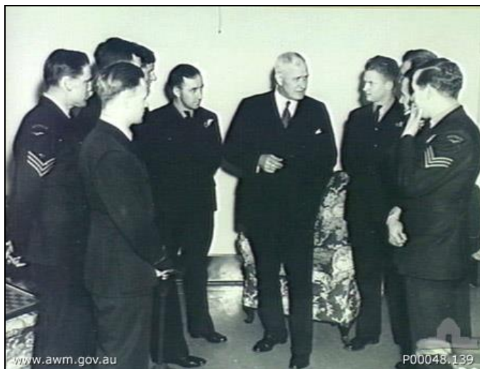
Major General Sir William Glasgow, Australia's High Commissioner to Canada, speaks with aircrew of the British Commonwealth Air Training Scheme in the Anzac club.

He established Anzac clubs in Ottawa and Halifax and during his tours publicised the Australian war effort. The University of Manitoba awarded him an honorary LL.D. in 1942.