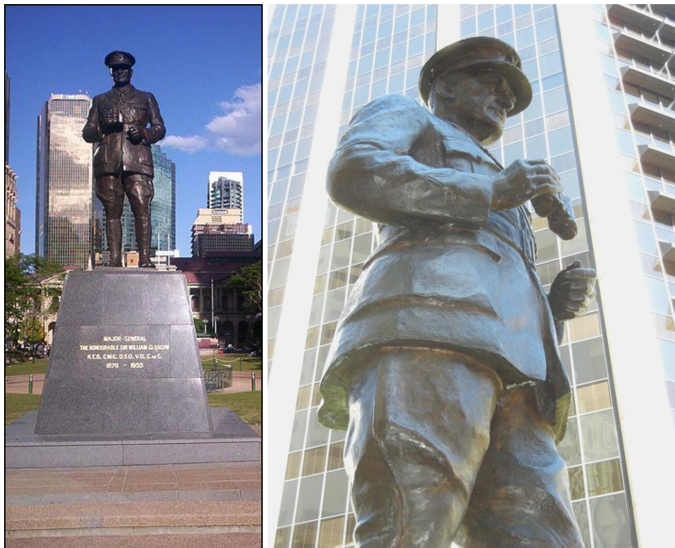
Statue at Post Office Square, Brisbane. (The statue is facing ANZAC Square.)

In 1966 a bronze statue of Glasgow by Daphne Mayo was unveiled at the junction of Roma and Turbot streets in Brisbane. At the ceremony Sir Arthur Fadden described him as one of the most distinguished soldiers of our age and generation . It was later moved to Post Office Square where it now overlooks ANZAC Square.