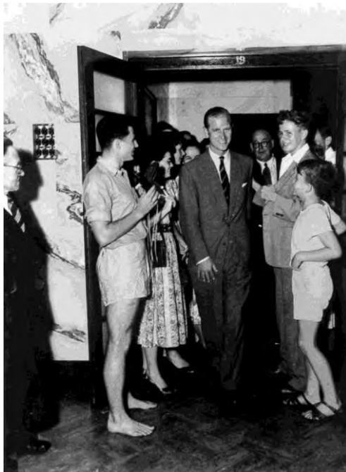
Prince Philip in Brisbane, 1954

The life membership was a way of formally recognising Prince Philip's visit to Brisbane, if not to the Club. The committee meeting following the Royal Visit read letters of thanks from members of the Royal Tour party who had been given honorary membership while in Brisbane.