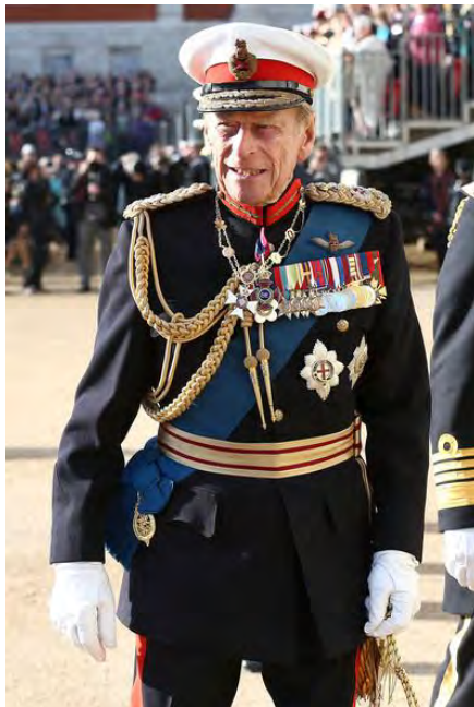
Prince Philip served as Captain-General of the Royal Marines for 64 years from 1953 to 2017

As an aside, Club Membership records describe Prince Philip's occupation as "retired" and address as "Buckingham Palace, London".